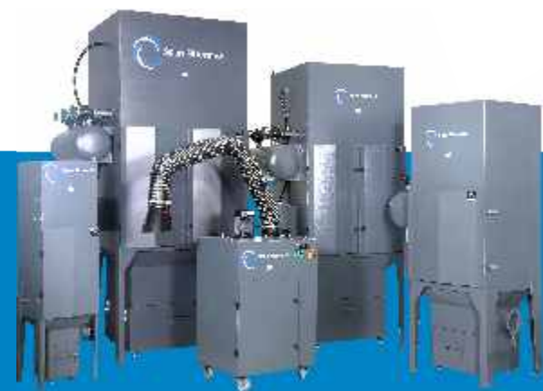
RANGE OF STAND ALONE DUST COLLECTORS

SFS Dust Collectors are engineered with a singular goal - to create best results for you. With innovative design and features, the Dust Collectors are successfully used to create a clean environment in variety of applications generating fine to coarse particulate dust.