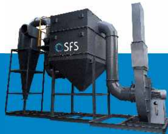
CENTRALIZED DUST COLLECTOR